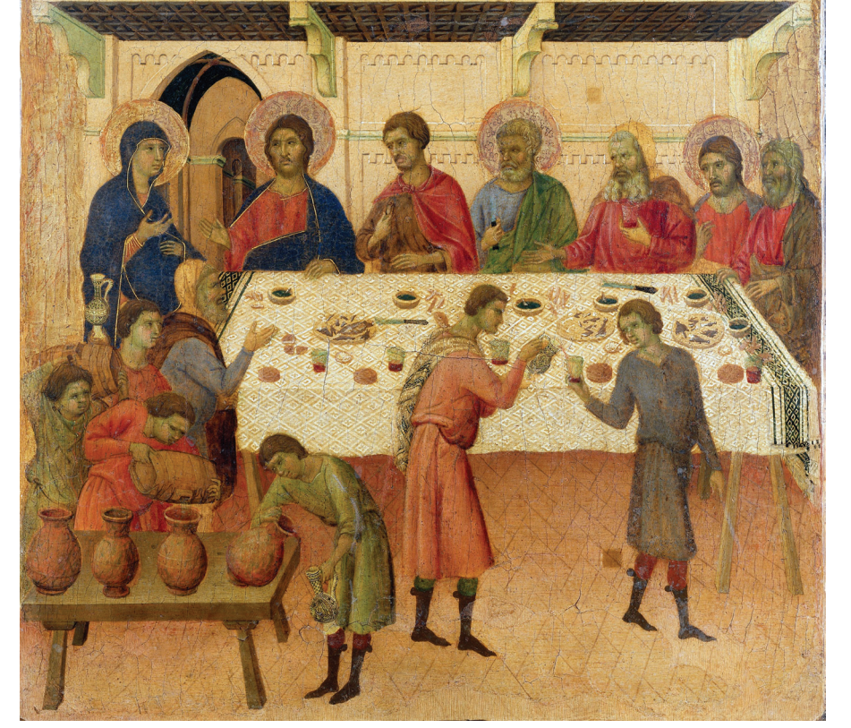
Duccio di Buoninsegna, The Wedding at Cana , 1308–11. Opera della Metropolitana di Siena, (Italy).

life to strive for wholeness and health for ourselves and others. If one is to take responsibility for one's sexual life as a human being, it will be exercised in such a way that it upholds the full humanity of the other. Marriage does not give us permission to abuse and violate the dignity of a spouse, or to use the spouse merely for selfish gratification. That would violate the dignity of the spouse's humanity and ours. We would become less than fully human in that act. To uphold the dignity of one's spouse, there has to be fidelity to the covenantal bond of marriage, in which each one commits to unconditional faithfulness to the other. The penitential canon of Saint Andrew of Crete testifies to the sanctifying effect of marital faithfulness in Ode 9: "Husbands and wives must be faithful to each other, for Christ blessed them by his presence at the marriage in Can ... that you, my soul, might likewise be transformed."